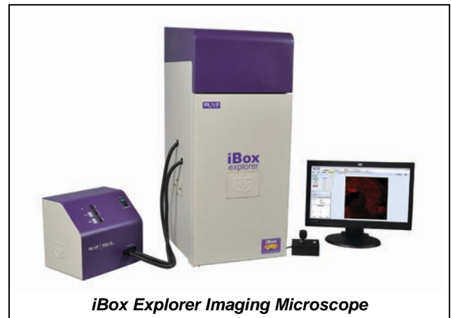
iBox Explorer Imaging Microscope

The field of cancer biology has been aided by intravital imaging systems which elucidate the microenvironment of tissues and the migration of cells. These imaging systems allow for visualization and quantification of cell movement, host and tumor interactions, intravasation and extravasation. The information gathered from quantitative and qualitative analyses of such studies sheds light on the largely unknown processes associated with migration of a tumor cell into the stroma and ultimately into distant sites. Understanding the mechanisms of invasion, intravasation, transendothelial migration and extravasation sheds light on the metastatic process and impacts the field of cancer therapeutics, especially since the vast majority of deaths associated with cancer are linked to metastasis from a primary lesion 1 .