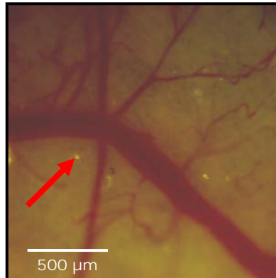
Figure 2: 8.8x magnification of a skin-flap. Migrated dual-colored HT-1080 cells (bright yellow) within a distal vessel have begun to extravasate. The field of view corresponds to a 1.7 x 1.7mm window.