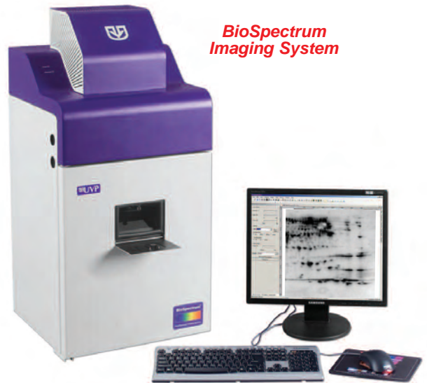
BioSpectrum Imaging System