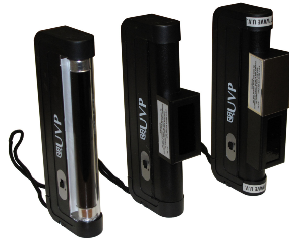
UVL-4 | UVG-4 | UVSL-14P