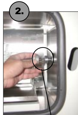
Pin Mount Placement